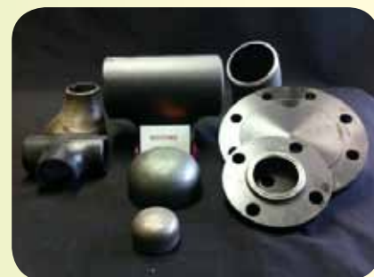
Hot Tap Fittings