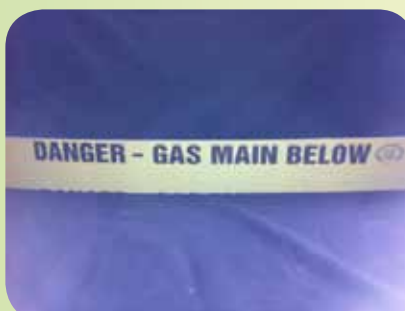
Gas Pipe Covers